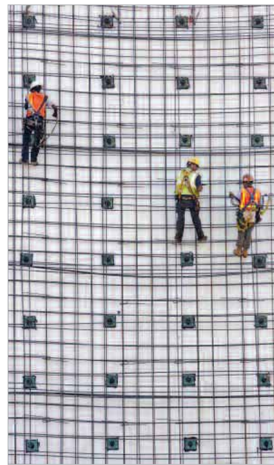
ABOVE: Workers tied rebar to the 50-foot outside foundation wall in September 2006.