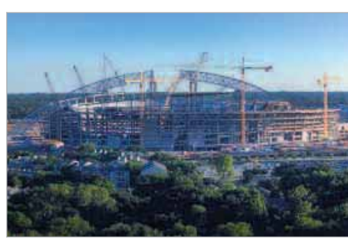
Oct. 9, 2007