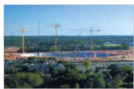
Sept. 26, 2006