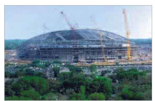
April 8, 2008