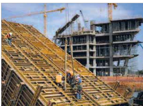
ABOVE: Workers in 2007 prepared structural abutments for concrete. The abutments anchor the arches that support the retractable roof.