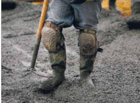
BELOW: A worker in February dragged mixed concrete being poured into a sidewalk form that circles the stadium's base.