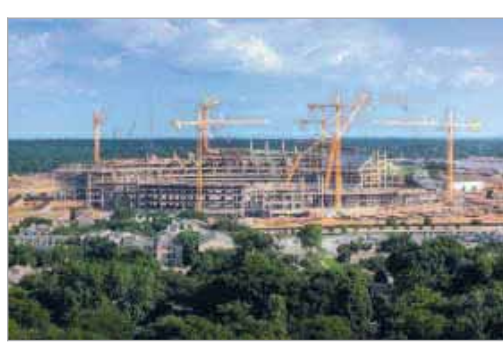
July 6, 2007